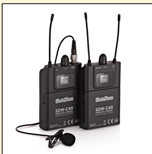
TYPICAL LAV MIC

HERE IS A PIC OF ONE TO ASK YOUR SOUND TEAM FOR: