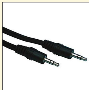
BOTH NEED THIS MINI JACK TO JACK TO CONNECT PHONE TO MIC