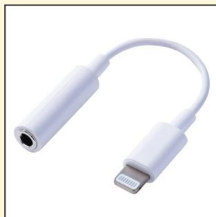
APPLE DEVICES NEED THIS CONNECTOR